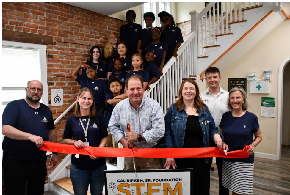
City staff and administration cut the ribbon to a new STEM Lab located at the Newton Community Center. STEM stands for Science, Technology, Engineering and Math and provides kids with opportunities to explore these fields in a fun environment. The products in the new lab were provided by a grant from the Cal Ripken Sr. Foundation and are all state-of-the-art learning materials geared towards kids in elementary and middle school. The Newton Community Center will be open Monday-Friday 11:30am-4:30pm this summer for free activities and lunch for children under age 18.