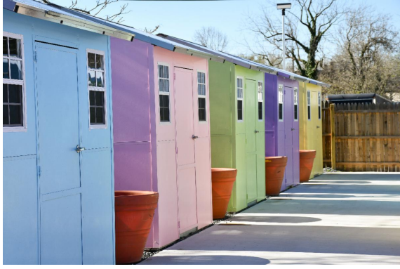
Anne St. Village transitional housing complex

For more information read the full public notice here