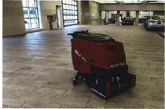
*Photo may not be an exact representation of quoted machine.