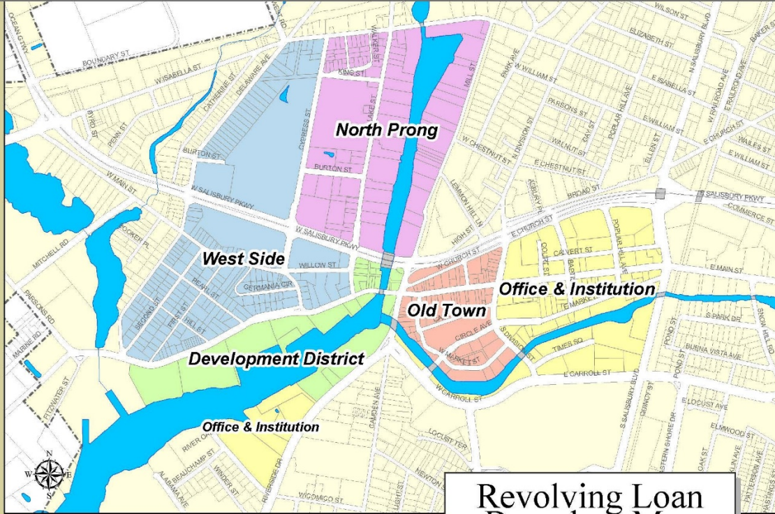
Revolving Loan Boundary Map

Salisbury Wicomico Planning Office 6/23/2014