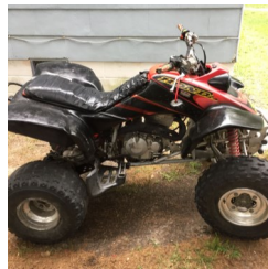
4 Wheeler (ATV) Operated by Jones

Traffic related charges of fleeing and eluding, failure to obey and reckless driving